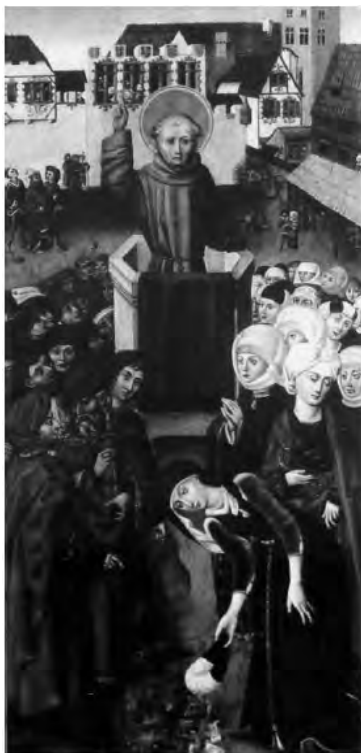
Figure 3: The sermon of Saint Giovanni da Capestrano, Historisches Museum.