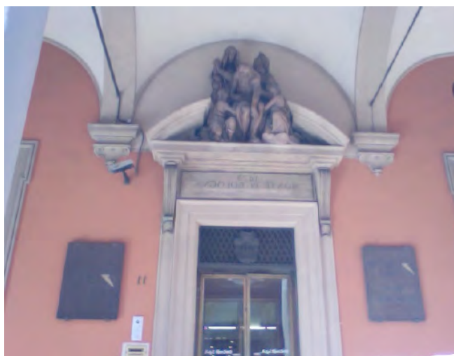
Figure 4: Monte di Pietà di Bologna