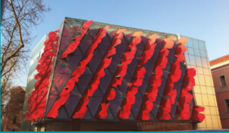
Mercè Rodoreda Building, site of the Barcelona Graduate School of Economics