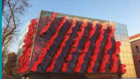
Mercè Rodoreda Building, site of the Barcelona Graduate School of Economics